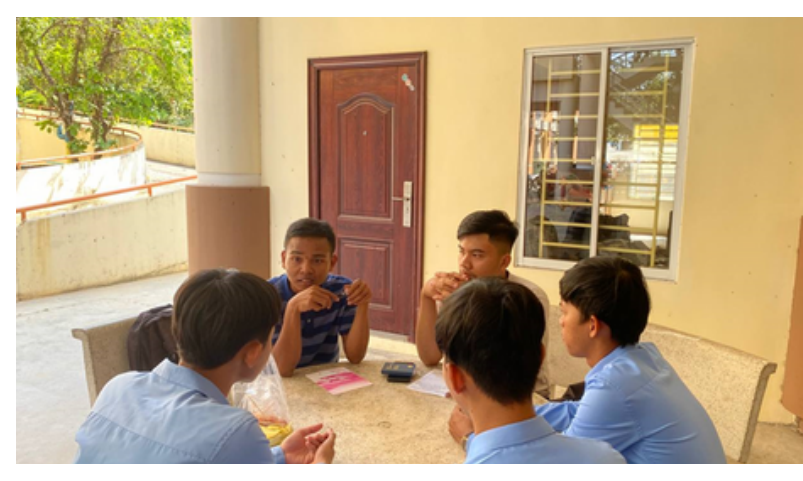
Campus team doing a follow up group study