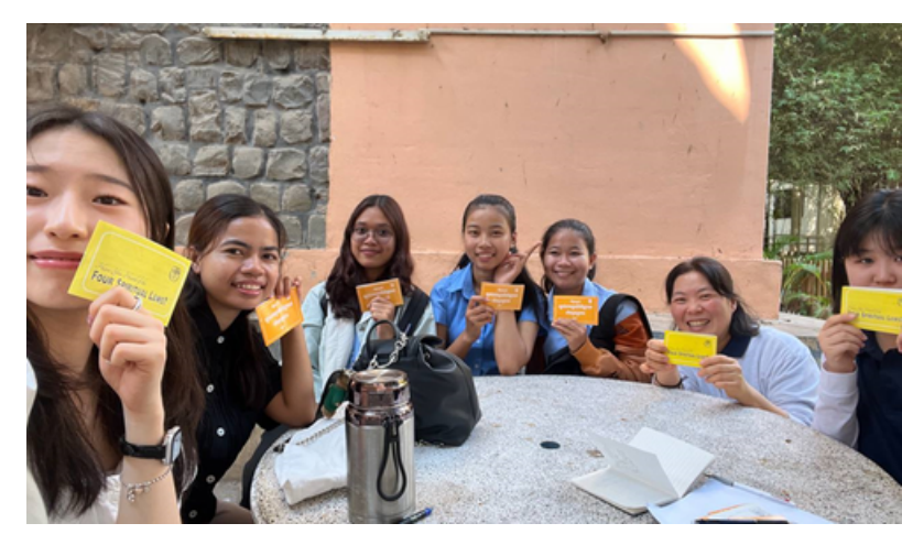
Campus team sharing the gospel with international mission teams