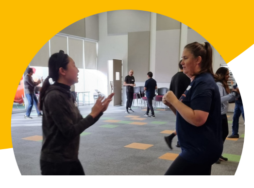
24 Self Defence sessions by Caydam Self Defence

Building a healthy by building a healthier you